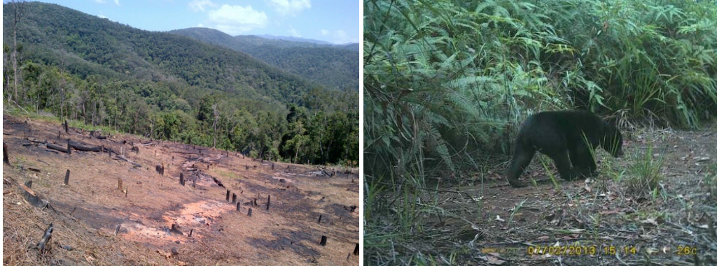
Figure 6 and 7. Destruction of surrounding forest by loggers and a recent camera trap image of a bear in the reserve.

Partner Organisation: Kalaweit Association