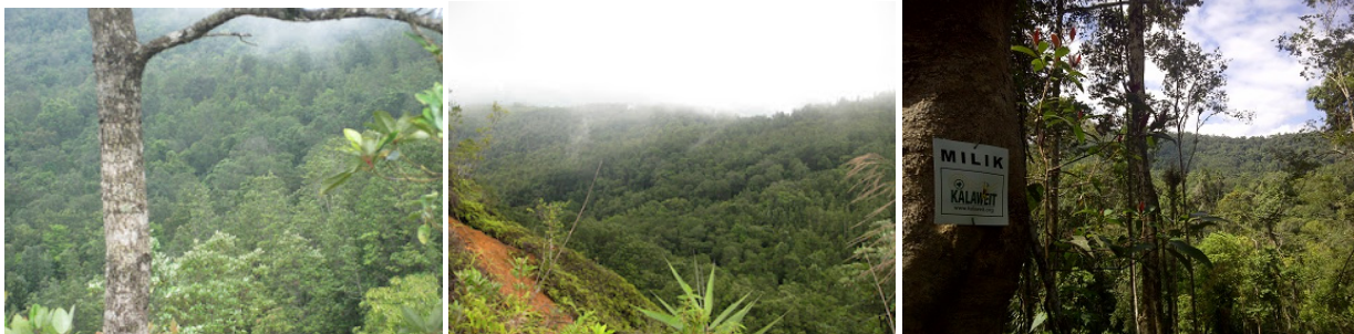
Figure 1-3. Supayang Reserve, Sumatra

The Supayang reserve lies at an altitude of 900 - 1050 meters and comprises of both primary and good quality secondary lowland forest. The area is rich in biodiversity and has been appropriately designated allowing the purchase of 99 ha to date. Kalaweit has recently negotiated an additional 36 hectares for purchase with the potential for an additional 200ha in the near future.